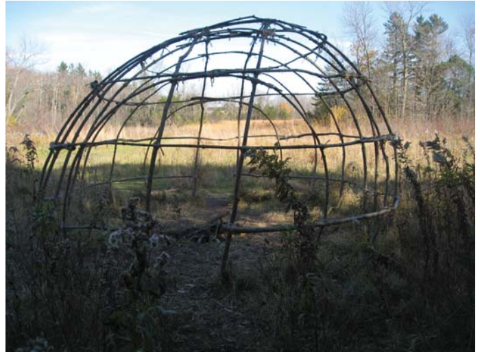
Our Wigwam is an influential teaching tool for the Native American class and helps us to understand how people use the structure, as well as how it was built.