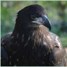
New Bald Eagle Page 6