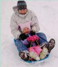
Winter Carnival Page 9