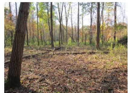
Figure 1. Before and after invasive clearing in the forest surrounding Solitude Marsh on SANC property; Notice the absence of native forest regeneration.