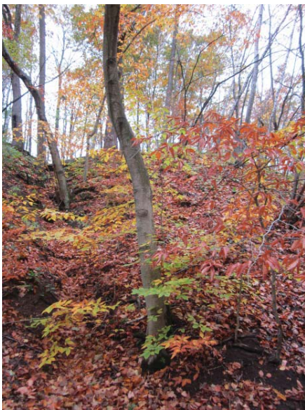
Figure 2. Natural beech regeneration occurring in one of our thriving northern hardwood forest remnants.

SANC has a mosaic of thriving northern hardwood forest remnants on bluffs and ravines that were spared from clear-cutting (Figure 2), destructive grazing and tillage. Additionally, we have regenerating forest areas that were disturbed by heavy agricultural use, such as logging, grazing, and tillage. Our young, previously disturbed forest areas harbor extensive populations of woody invasives, which we work mightily to combat. Our northern hardwood forest remnants still have dynamic understory plant and animal communities in which natural forest regeneration continues. These areas require ongoing monitoring and weeding to thwart invasive encroachment from neighboring areas. Although this is a common story, we are now at an unprecedented time in history. Therefore, we are taking an accelerated and progressive approach in the light of the