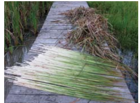
Cut, cleaned and sorted cattail leaves ready to be woven into wigwam matting.

Learn more about the newly constructed American Indian Wigwam in the "Boomers and Beyond" program here on November 4th.