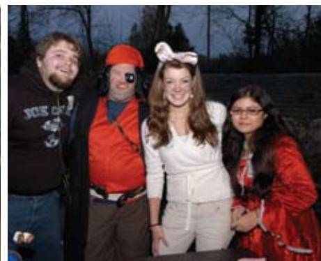
Join us as a volunteer for the Halloween Hike October 30th