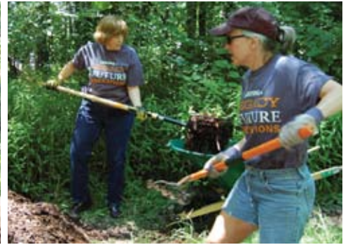
Thanks to our volunteers from Northwestern Mutual