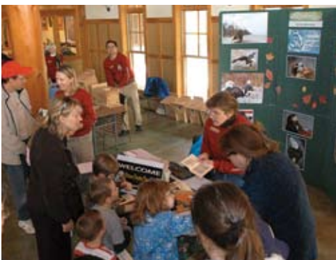
Volunteers working at last year's Xtreme Raptor Day